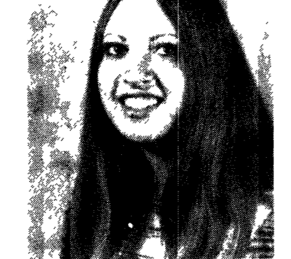
Rainbow Girls install president

Diego, as well as in England, Scotland, Ireland and Holland. The group plays a complete set of 61 bells covering the full five-octave range of an organ. The bells were cast in Holland by the Petit and Frisken foundry who, in their 300 year history, have produced most of the world's carillons.